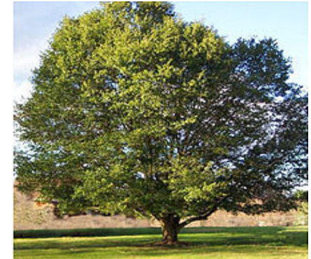
Live oak (Quercus virginiana)

Department of Planning, Bureau of Resource Management